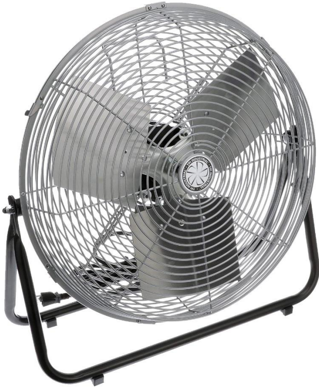
Gallery Image of F-TE Series Industrial Workstation Floor Fan