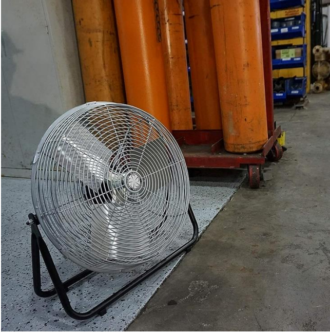
Gallery Image of F-TE Series Industrial Workstation Floor Fan